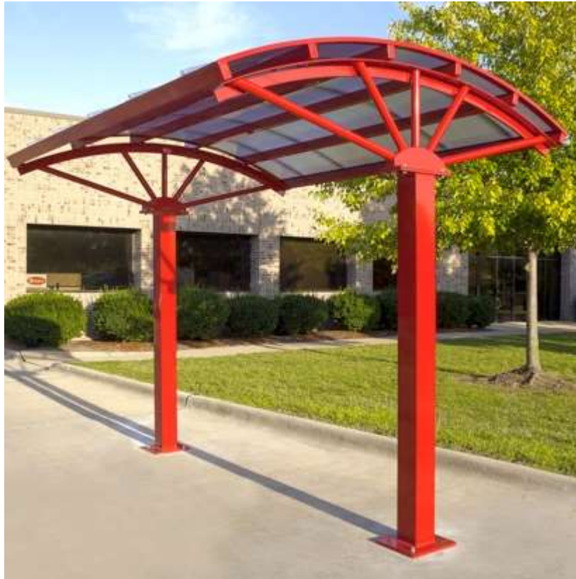
BICYCLE SHELTER CHARACTER IMAGE