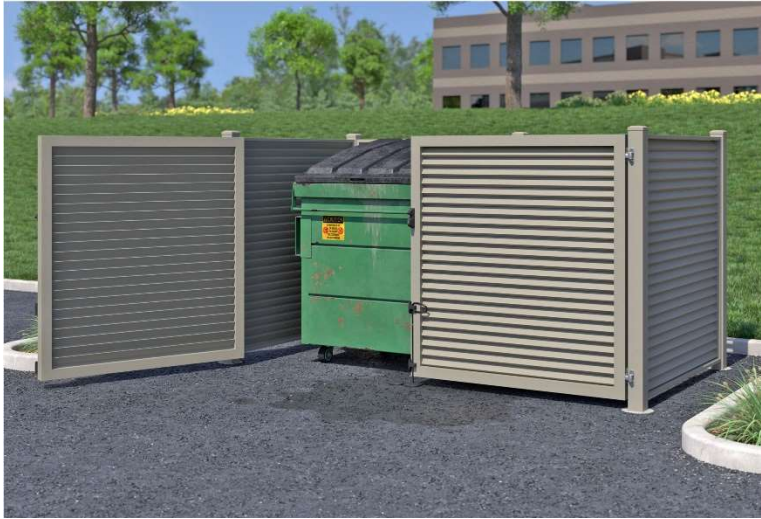
METAL LOUVERED TRASH ENCLOSURE