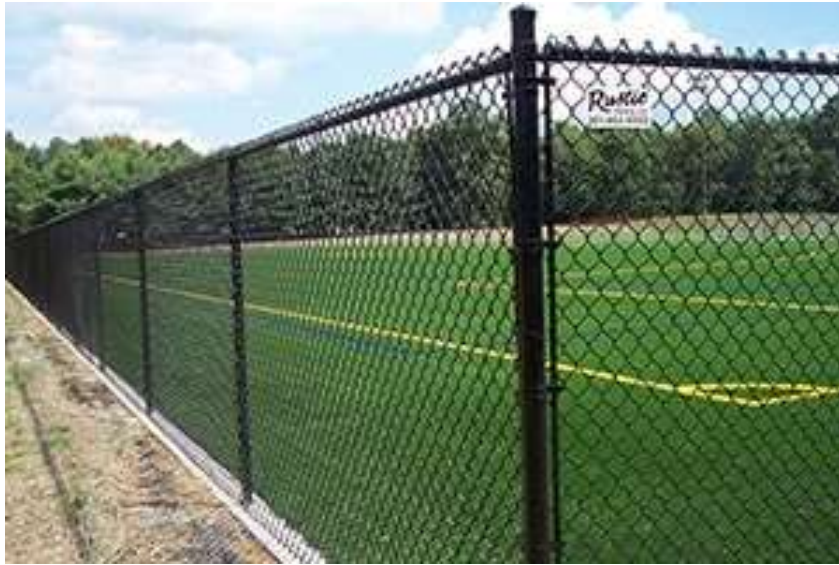
CHAINLINK FENCING CHARACTER IMAGE