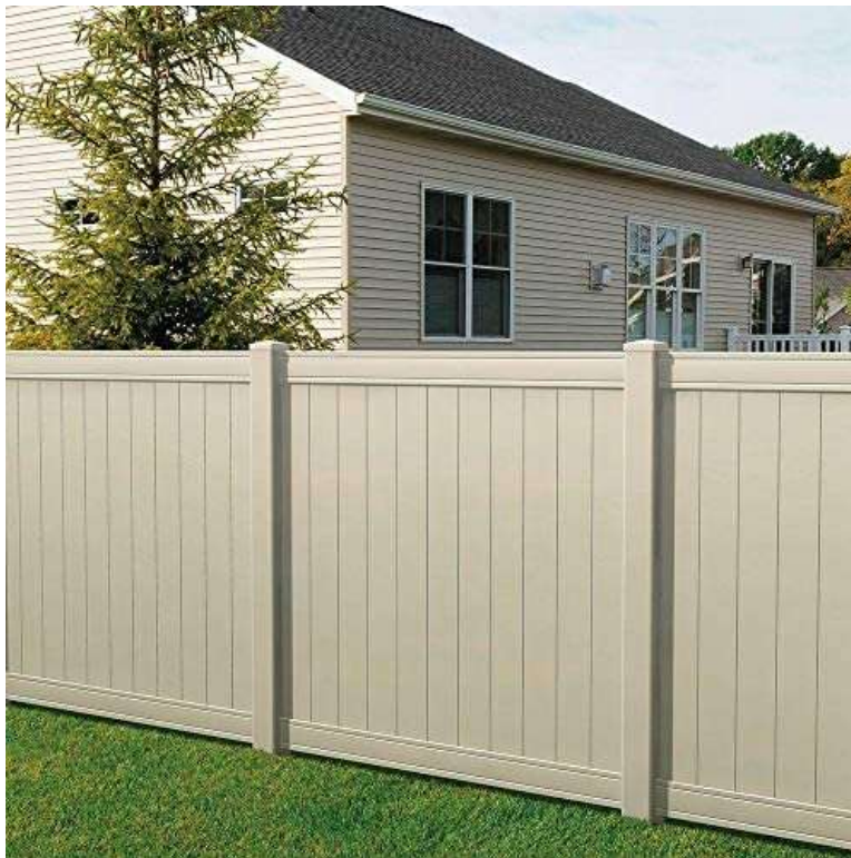
6' OPAQUE FENCING CHARACTER IMAGE