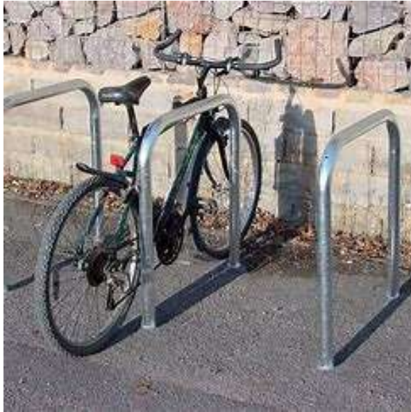
STEEL BIKE RACK UNIT – SPACES FOR 5 BICYCLES.