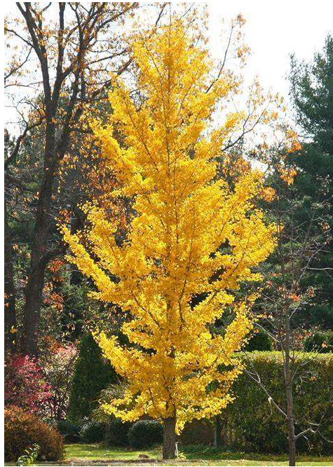
GINKGO TREE – LOCATED IN THE REAR PARKING LOT.