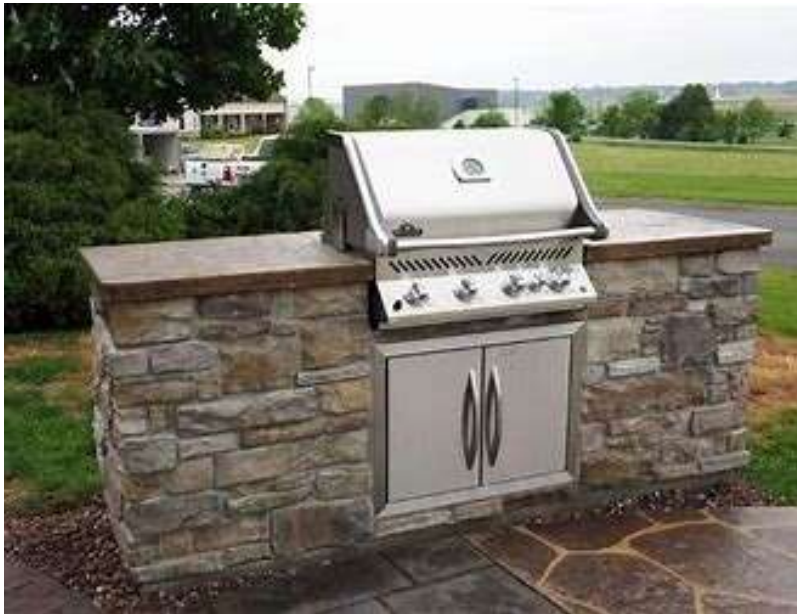
GRILL STATION CHARACTER IMAGE.