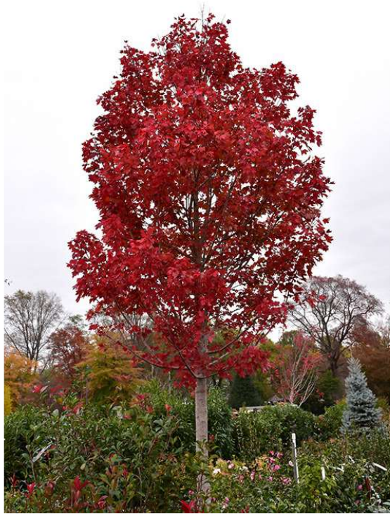
RED MAPLE – LOCATED ALONG NORTH AVENUE AS A STREET TREE AND OUTSIDE OF THE PERIMETER RETAINING WALL.