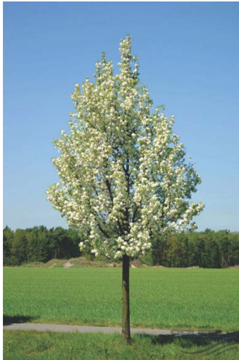
FLOWERING PEAR – LOCATED TO THE LEFT AND RIGHT OF THE BUILDING'S FRONT ENTRANCE AND SOFTENING THE SOUTHEAST FACING FRONT CORNER.