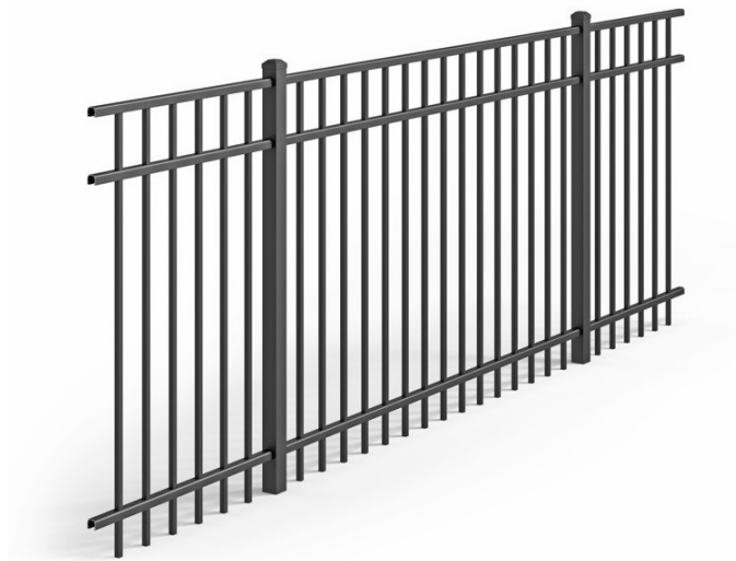
METAL PICKET FENCING