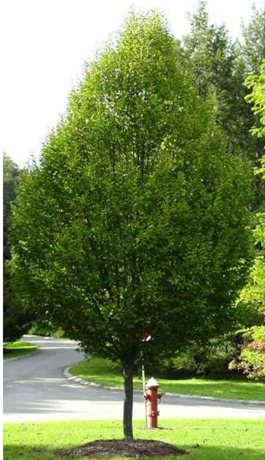
HORNBEAM – LOCATED AT THE REAR FAÇADE OF THE BUILDING.