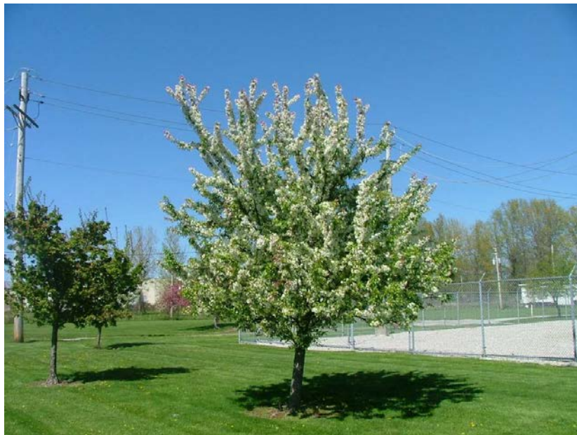
FLOWERING CRAB – LOCATED ALONG THE NORTHEAST EDGE OF THE SITE ENTRANCE PARKING LOT.