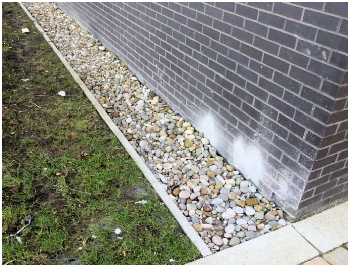
GRAVEL MAINTENANCE STRIP AT BUILDING