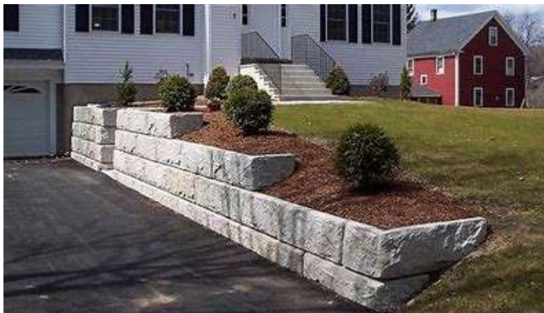
PERIMETER RETAINING WALL IMAGE