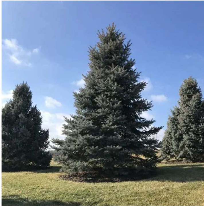
BLUE SPRUCE – LOCATED ALONG NORTH AVENUE SCREENING THE SITE ENTRANCE PARKING LOT AND FIRE PIT AREA.