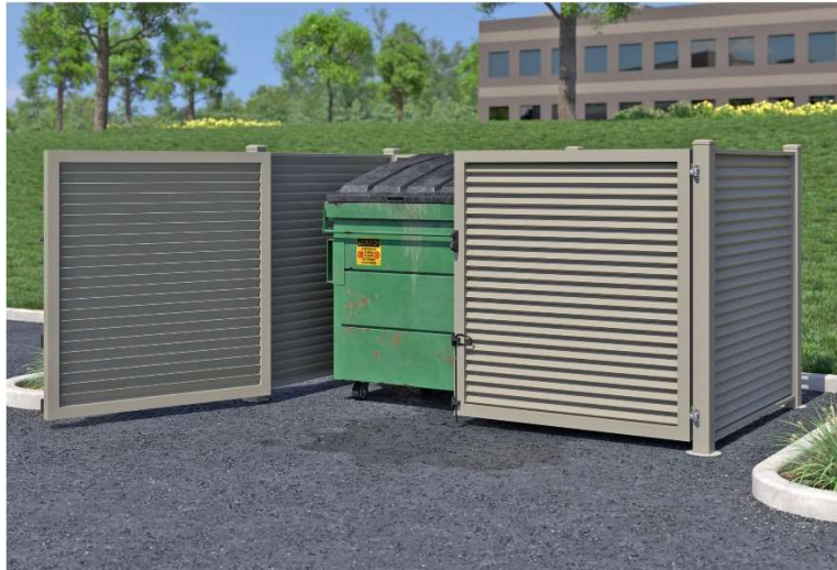
METAL LOUVERED TRASH ENCLOSURE