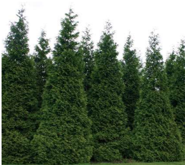
WESTERN ARBORVITAE – SCREENING FOR THE FIRE PIT AREA AND ADJACENT TO THE KNIGHTS OF COLUMBUS PARKING LOT.