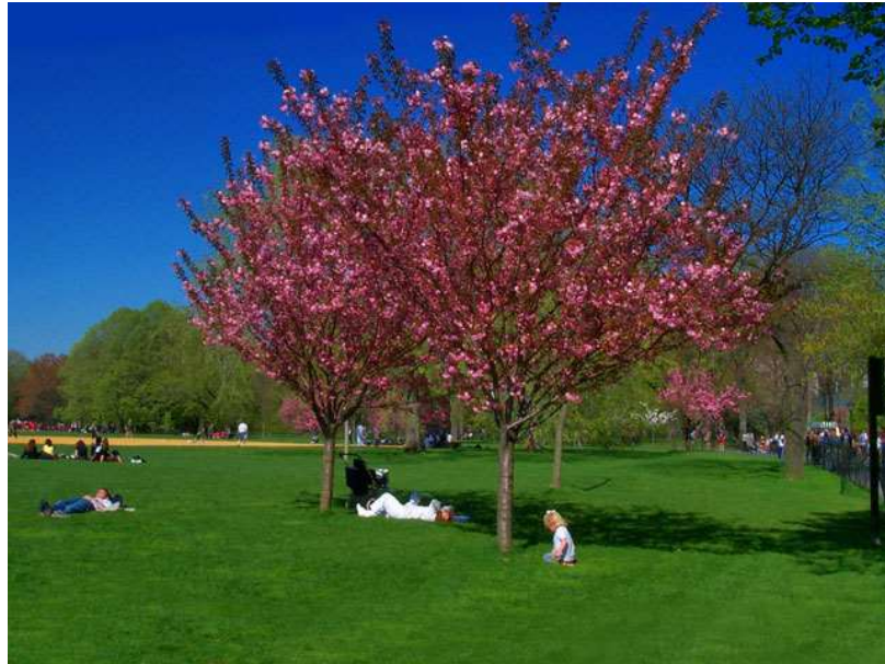
KWANZAN CHERRY – GROUPS OF THREE LOCATED ON THE LEFT AND RIGHT SIDE OF THE BUILDING'S NORTH AVENUE ELEVATION.