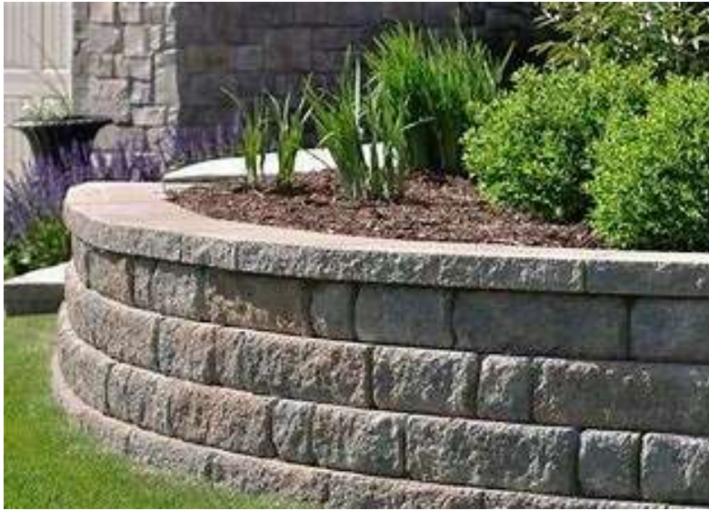
AMENITIES AREA RETAINING WALL CHARACTER IMAGE.