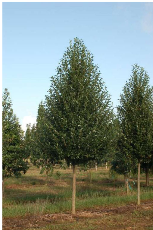
TUPELO – LOCATED IN THE REAR PARKING LOT AND BEYOND THE PERIMETER RETAINING WALL ADJACENT TO THE WETLAND.