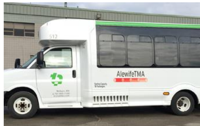
CC&F/TransAction Alewife Shuttle