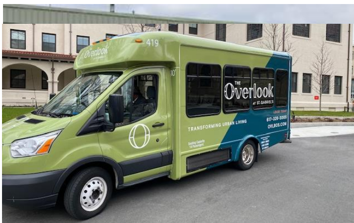
CC&F/TransAction Brighton Shuttle